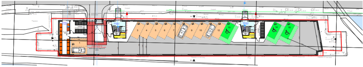
1 GF-Ground Floor (1) 1:200