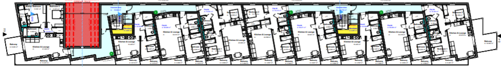
2 01-First Floor 1:200