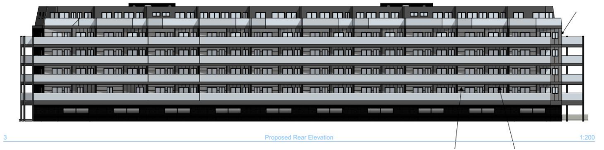
3 Proposed Rear Elevation 1:200