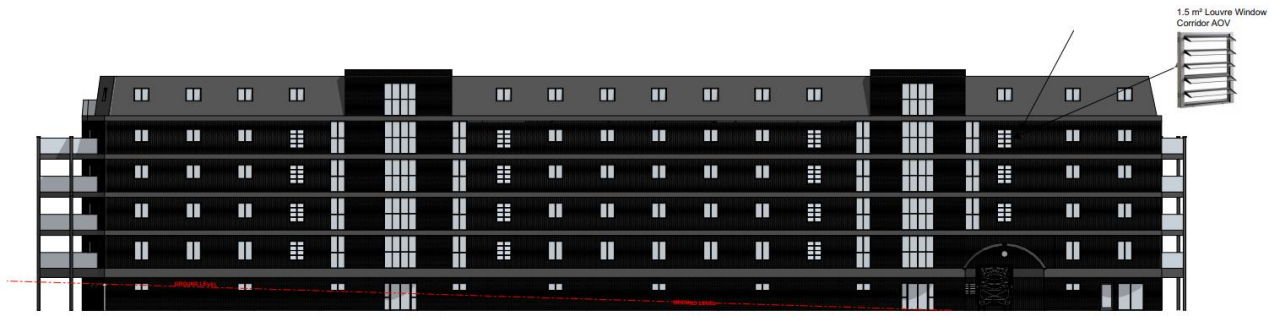
1 Proposed Front Elevation 1:200